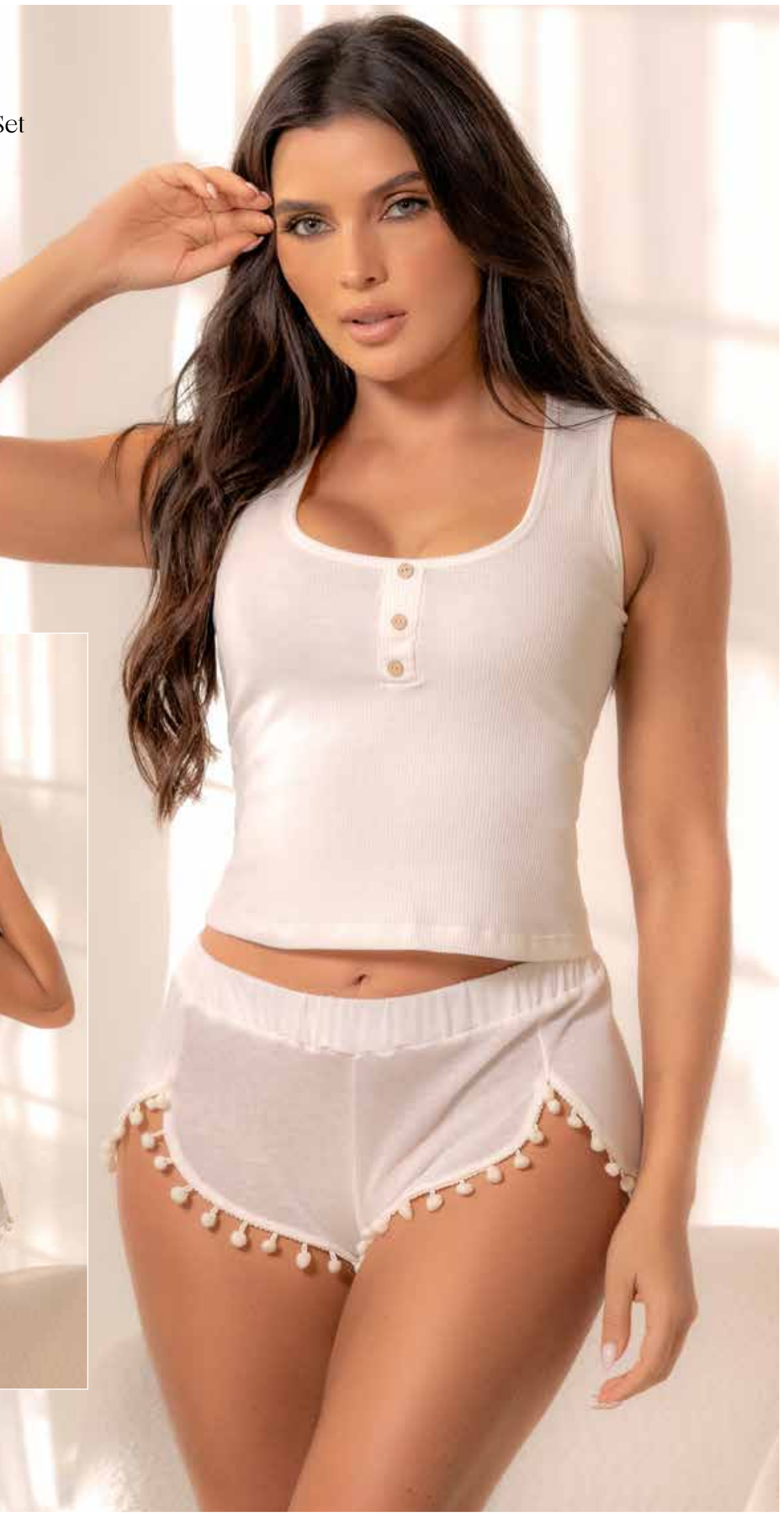
17 Mapalé Lounge